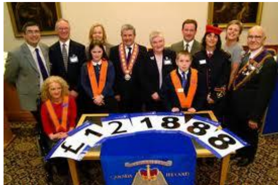
LOL1063 contributed to this record donation to Cancer Research from Grand Lodge of Ireland.

Charity is an important part of the work any Orange lodge. Newtowncunningham LOL1063 has supported Donegal Hospice, Meningitis Trust, Cancer Research, Earl Haig Fund, Alzheimer's Ireland, Crumlin Childrens Hospital, Guide Dogs for the Blind, All Saints Church of Ireland Newtown, Moyle National School, Greenbank Hall Rebuilding Fund and Help for Heroes to name but a few. Lodge members take part in the Portrush Raft Race in support of the RNLI. Members also give generously to the various Orange Charities.