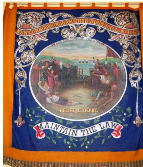
Oldest known LOL1063 banner, now in Donegal County Museum.

Orange Banners arguably form the most visible and interesting spectacle at parades and are designed to represent the private lodges' identity. Newtowncunningham has had four (or possibly five!) banners in their history. There may have been an older banner but the oldest surviving banner is now held in Donegal County Museum. The next surviving banner purchased in 1953, depicts a magnificent Battle of the Boyne scene and on the reverse "The Angel with the Book". In March 2000 another banner was unfurled replacing the tattered and torn 1953 banner. It has "The Open Bible & Crown" as its reverse side. In May 2011 the lodge unfurled a new banner to mark their centenary. This depicts the Lodge's War Memorial on one side and King William on the other and is a magnificent banner that will represent Newtowncunningham at parades for many a year to come.