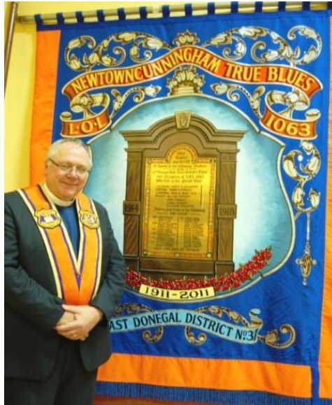
New Centenary banner unfurled in May 2011.

Charity is an important part of the work any Orange lodge. Newtowncunningham LOL1063 has supported Donegal Hospice, Meningitis Trust, Cancer Research, Earl Haig Fund, Alzheimer's Ireland, Crumlin Childrens Hospital, Guide Dogs for the Blind, All Saints Church of Ireland Newtown, Moyle National School, Greenbank Hall Rebuilding Fund and Help for Heroes to name but a few. Lodge members take part in the Portrush Raft Race in support of the RNLI. Members also give generously to the various Orange Charities.